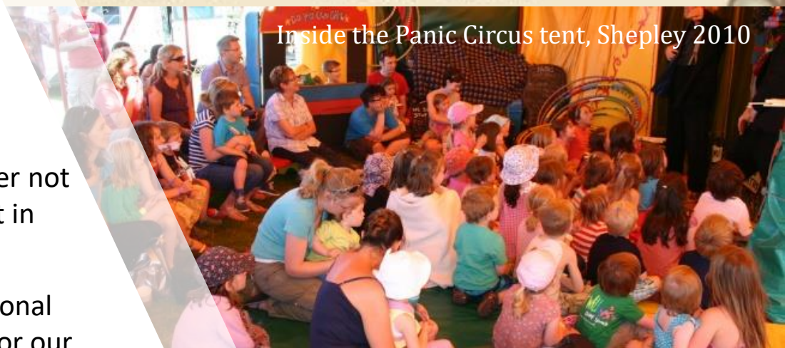
Inside the Panic Circus tent, Shepley 2010