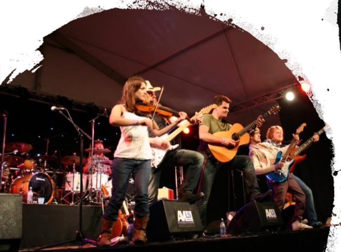
Friday night with the young Albion Band 2012