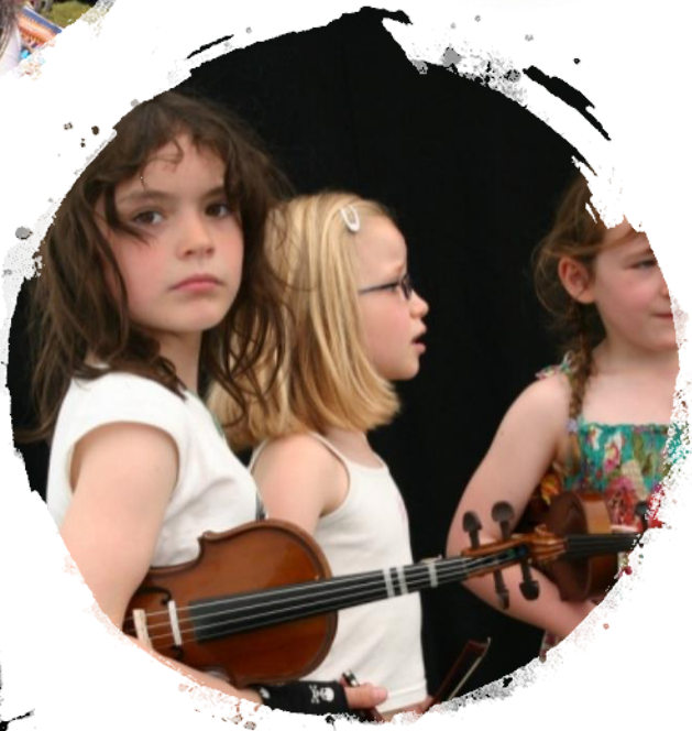
Young musicians waiting backstage at the Children's Showcase

Staging the event in 2019 will cost approximately £30,000.